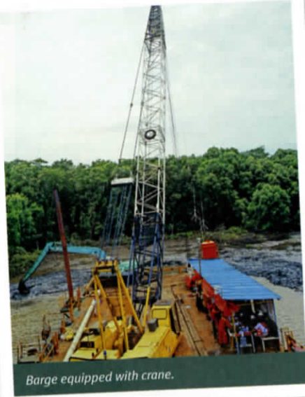
Barge equipped with crane.