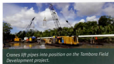
Cranes lift pipes into position on the Tambora Field Development project.

The onshore activity was tide-dependent and the movement of flexi-yoke barges was possible only during the high tide. Tie-ins and other associated activities such as radiography and field joint coating were performed at low tides.