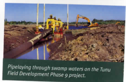
Pipelining through swamp waters on the Tunu Field Development Phase 9 project.