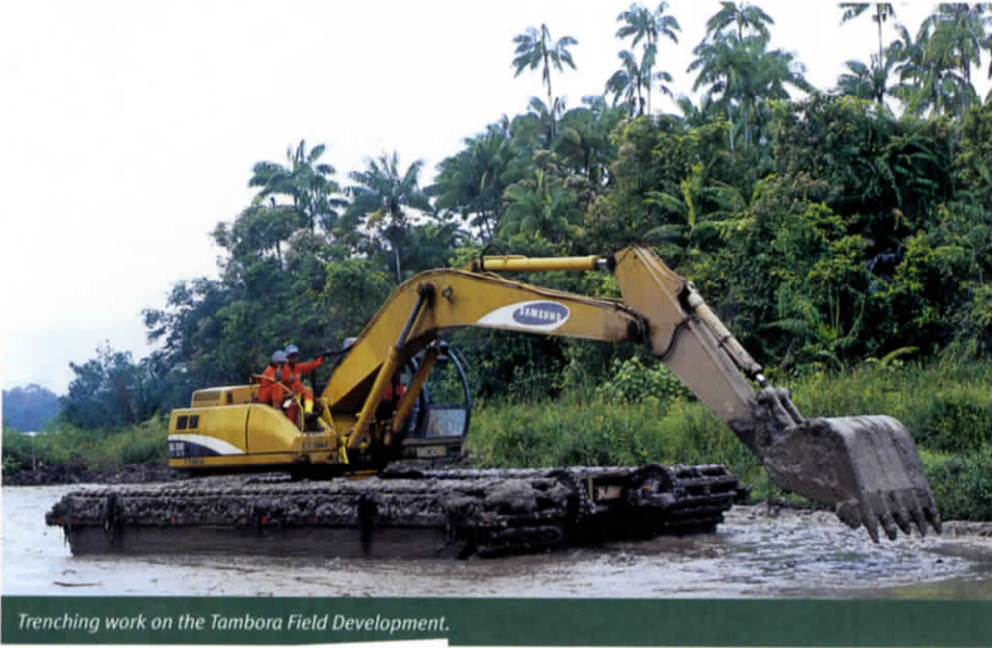
Trenching work on the Tambora Field Development.